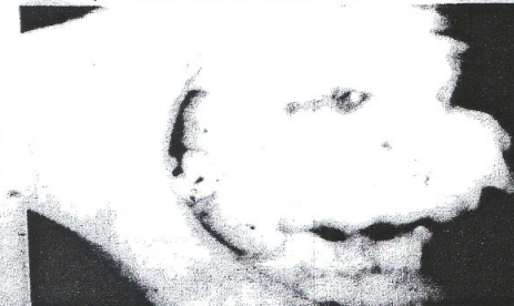
LIP BITING also brings malformation of the growing teeth. Note the space between the two upper teeth.