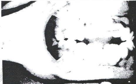
THUMBSUCKING prevents the teeth from coming together due to the constant insertion of the digital member.

In the meantime, look at the illustrations included herein. One shows the malformation of the teeth due to tongue sucking, another due to lip biting and a third from thumbsucking. If any of these habits are detected and corrected at an early enough age, the incorrect alignment of the teeth may correct itself. All of the illustrated cases had to be corrected by means of special dental appliances.