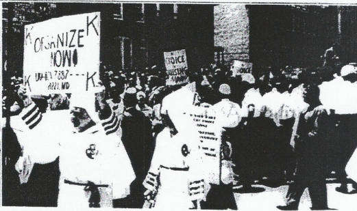
MOMENTS LATER these KKK members were huddled together under police protection trying to reach safety, from angry Negro population.