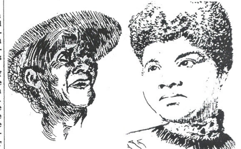
NANNIE BURROUGHS (l.) founder of a great training school for women and Ida B. Wells Barnett (r.) famous journalist and civic leader, both honored in new Freedom Calendar.

heels when driving. It may not be fashionable, but it's much safer."