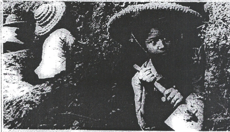
YOUNG WOMEN of Hanoi dig their own shelters on a hillside, as part of their training against possible attack. The heavy straw hats they wear are designed as protection against shell fragments from U. S. bombings of Viet-

THE AREA, which is located in the Himalayas, was inspected by the Health Minister. Medical teams already have gone in and the government has taken steps to prevent an epidemic of the highly contagious disease.