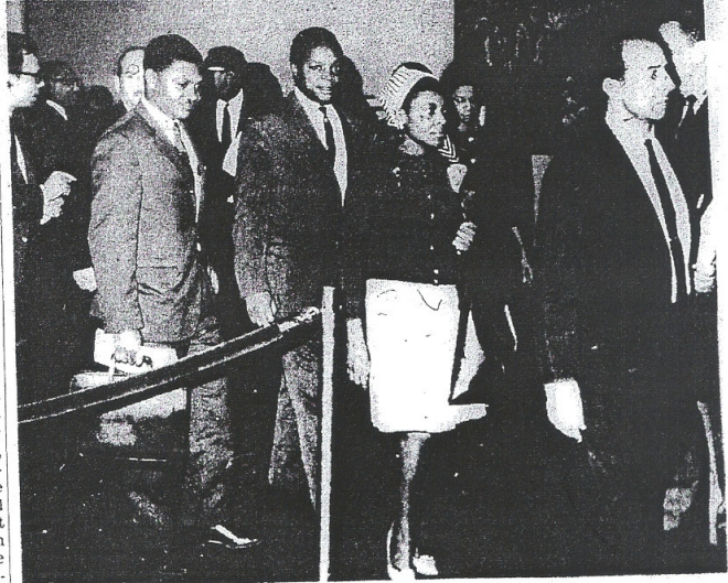
AFRICAN DELEGATES walk out of the United Nations General Assembly during speech by British Prime Minister Harold Wilson, whose hypocritical policies permitted Rhodesia's white supremacy regime to declare unilateral independence which terminated chances of

black Rhodesians to have representative government. Most of African delegations walked out during the speech, refusing to listen to Wilson's two-faced appeal for support of British policy on Rhodesia.