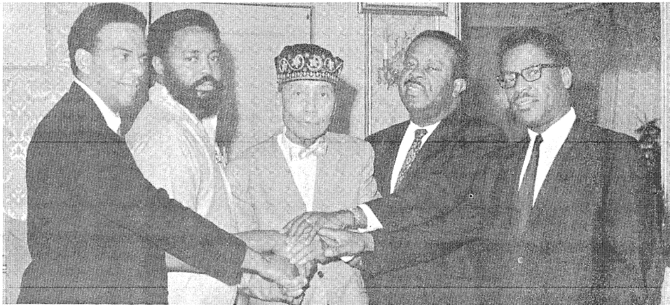
THE HANDCLASP OF UNITY of the Black brotherhood of the Nation of peace (Islam) is extended in the home of the Honorable Elijah Muhammad between the Messenger of Allah and members of the Southern Christian