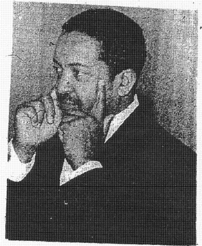
The Honorable W.D. Muhammad Supreme Minister

We have the unfailing knowledge of Divine Mind to raise you up into manhood